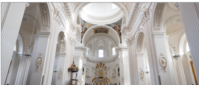
Houses of Worship