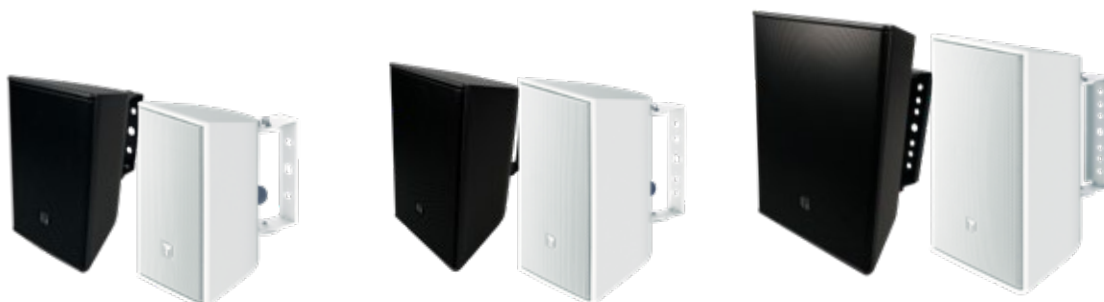
F-03BT-WP-UE / F-03WT-WP-UE