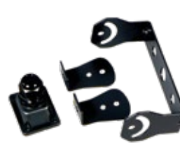
Accessory: Speaker mounting bracket for EN54 and WP versions (included)