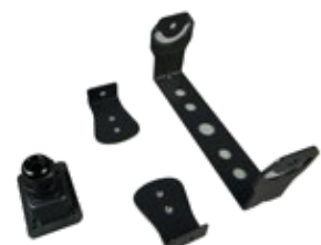
Accessory: Speaker mounting bracket for EN54 and WP versions (included)