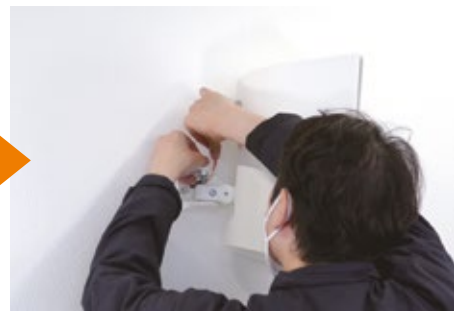
Wiring with Both Hands