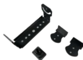
Accessory: Speaker mounting bracket for EN54 and WP versions (included)